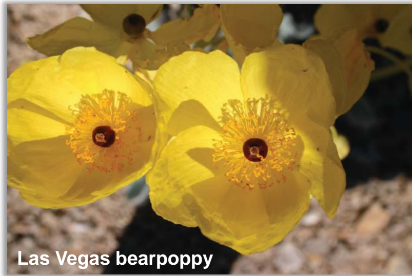
Las Vegas bearpoppy